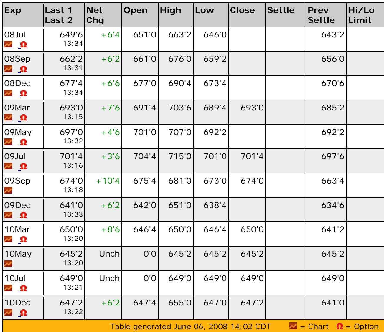
Table generated June 06, 2008 14:02 CDT