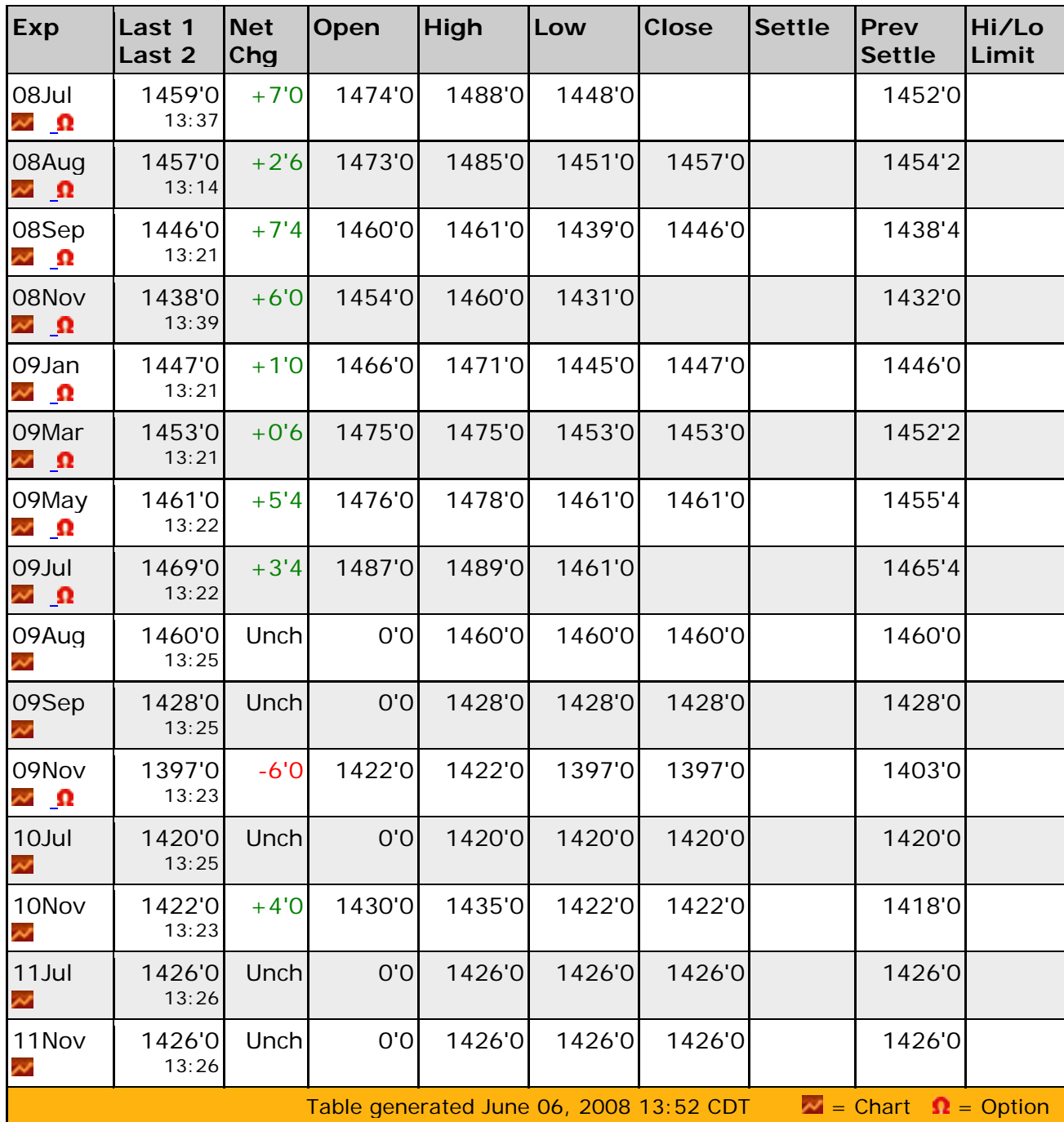
Table generated June 06, 2008 13:52 CDT